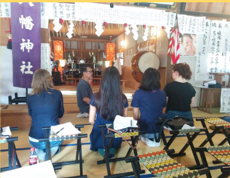
Inside of Jinguji