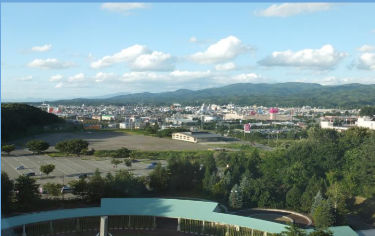
The combination of eight cities known Today as Yokote

Yokote now sports a population of over 100,000 people and is known for its agricultural produce. In 2008, 8 cities (Yokote, Omori, Masuda, Jumonji, Sannai, Taiyu, Hiraka and Omonogawa) within the neighbouring areas combined to create what is now known as Yokote city. Yokote is often described as a heritage city with various sites such as Yokote Castle and Samurai residences.