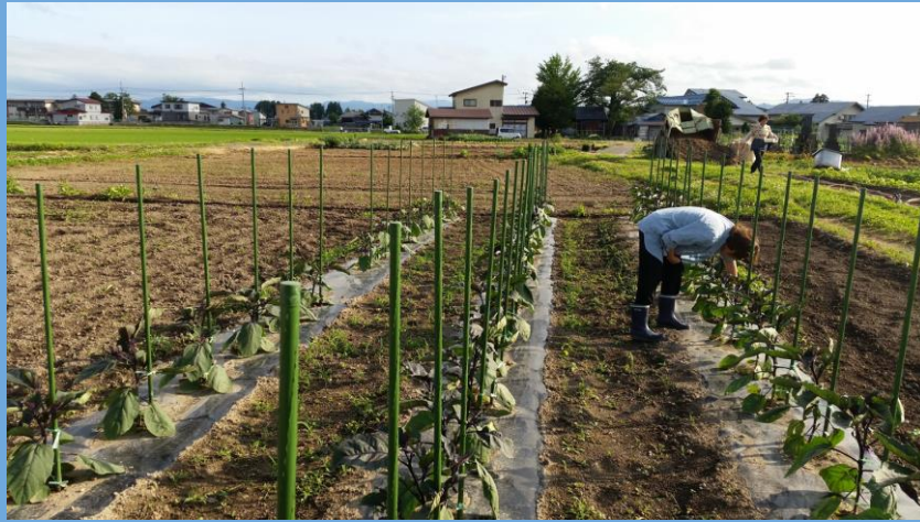
Yokote resident farmer

“Yokote, a town of 10,000 people with a large trade in cottons.” (Bird, 288)