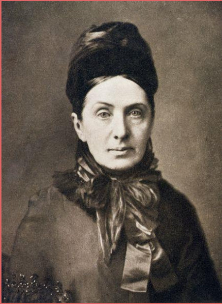
Isabella Lucy Bird

"The great melancholy stare is depressing." (Bird, 287)